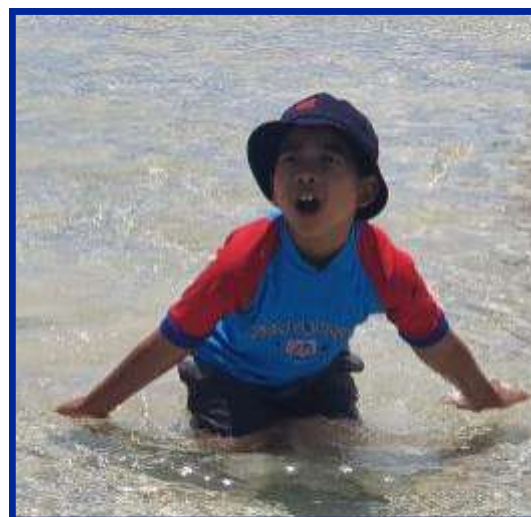
Thank you PORT HUGHES! We had a great day in the sun!