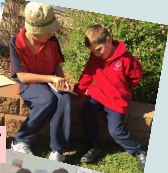
UP class got to choose new books for the library.