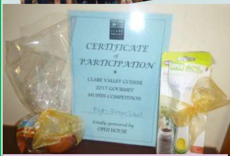
Congratulations on great cooking and winning a prize for the yummy tasting muffins.