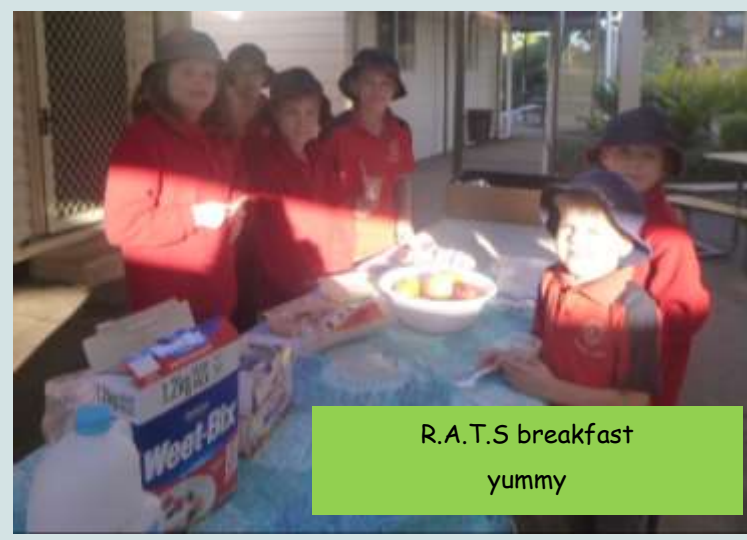
R.A.T.S breakfast yummy