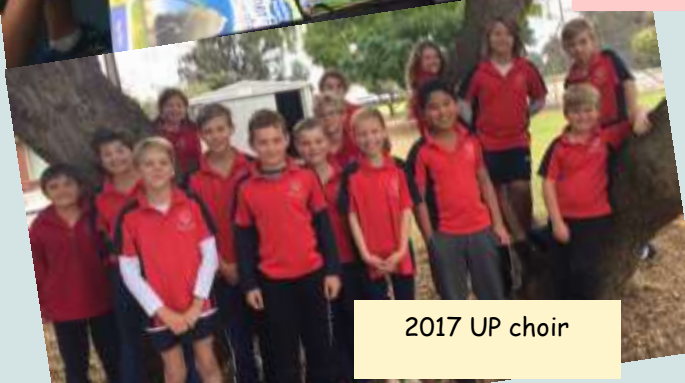
2017 UP choir